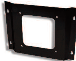
Optional Mounting Bracket